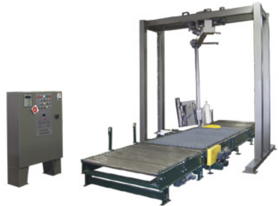
INFRAPAK RTAC Series

The INFRAPAK RTAC is a sleek fully automatic rotary tower stretch wrapping system that indexes loads, automatically stretch wrap loads and discharges loads without operator assistance